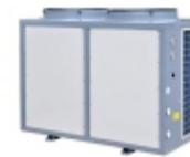
Commercial Air Source Heat Pump