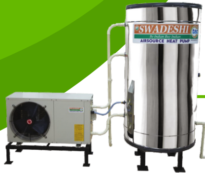
Domestic Air Source Heat Pump

Air source Heat Pump Water Heating system works with a proven high performance and power saving technology and regarded as 4th generation water heater. It is unique because, approximately 75% of total heat energy generated is absorbed from surrounding air & 25% from electricity. It can be installed in Hospitals, Hostels, Pgs, Villas, Hotels & Apartments.